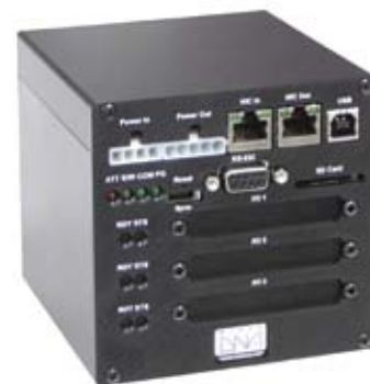
Core Module consists of NIC and PowerPC CPU layers stacked on top of each other and packaged in light-weight aluminum chassis.