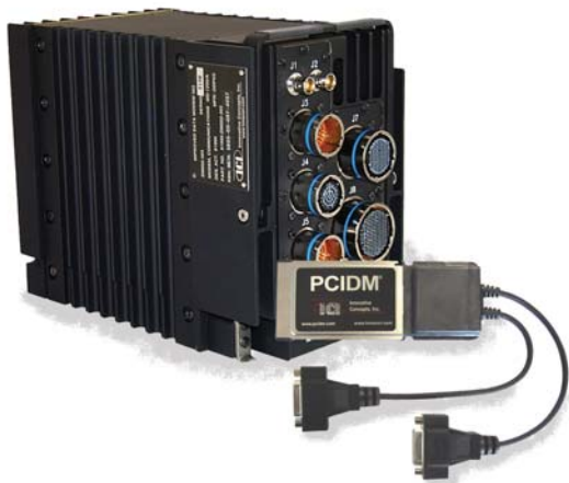
Innovative Concepts' IDM features LynxWorks' LynxOS real-time operating system

Plans are underway for ICI's IDM to incorporate an embedded subset of the Army's innovative Force XXI Battle Command, Brigade and Below (FBCB2) System software called EBC (embedded battlefield command), which satisfies the Army's growing trend toward smaller, handheld com-